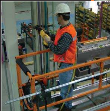
Application-Specific Tools to Do Your Best Work