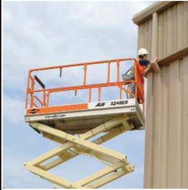
Longer Duty Cycles Keep You On the Job Longer