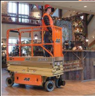
Quieter, Cleaner Operation for Indoor Work Areas